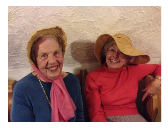
How well we know that smile!