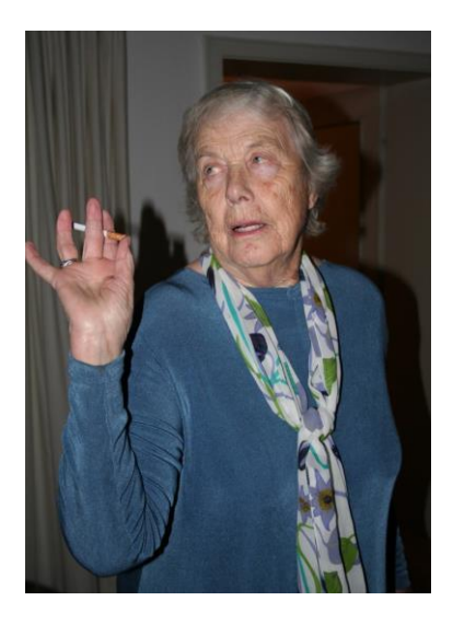
"Darlings, it is just divine!"