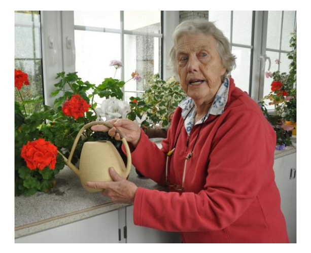
Dee in 2014