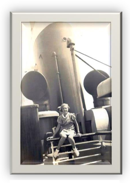
1938 on the SS Washington at Le Havre