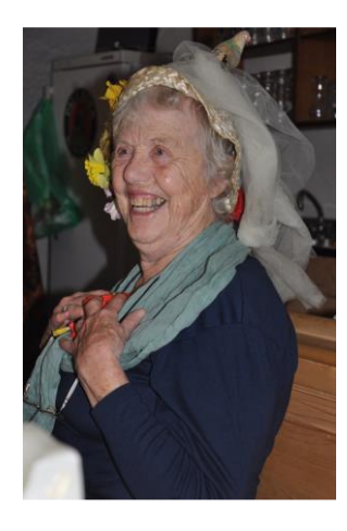
Where did she get that hat!