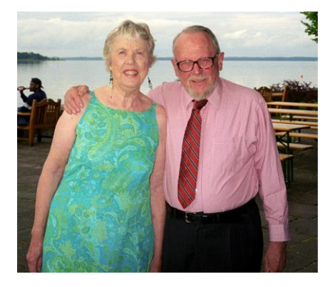
A Special Wedding Anniversary