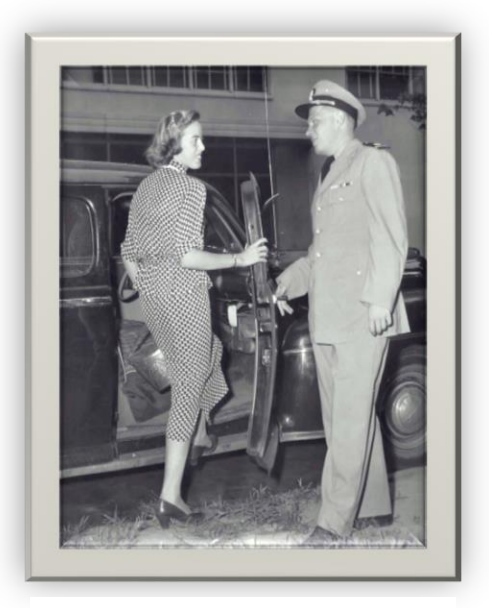
Courting days: Washington Post and Navy