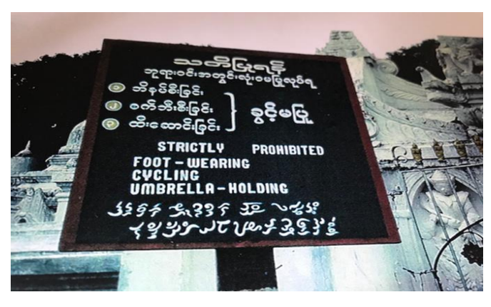
LOST IN TRANSLATION....